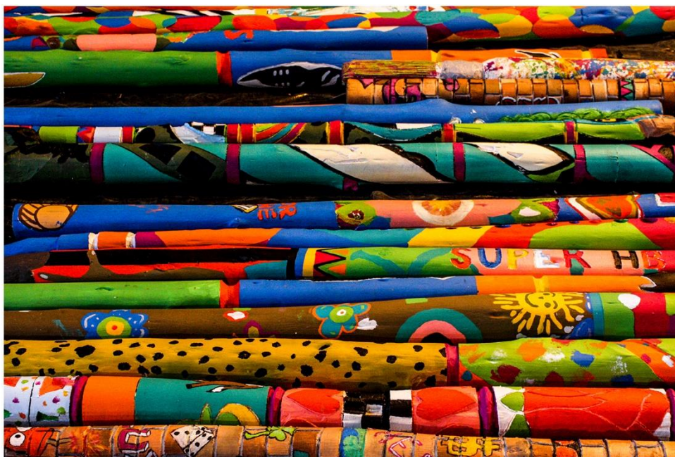
Rotunda – Hand Carved Totems (Vertical Markers for Rotunda Linear Park upgrade area) (2018)