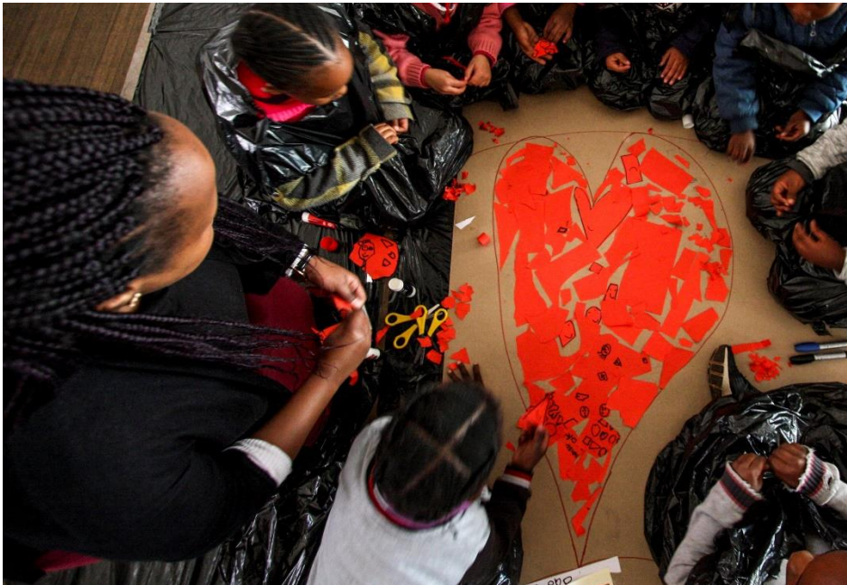
Rotunda – Workshop with Super Juniors Pre – Primary School to extract designs for Rotunda Linear Park surface painting. (2018)