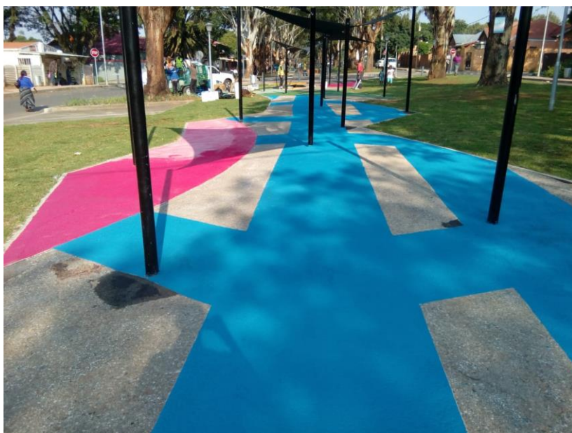
Rotunda - Rotunda Linear Park surface painting. (2019)