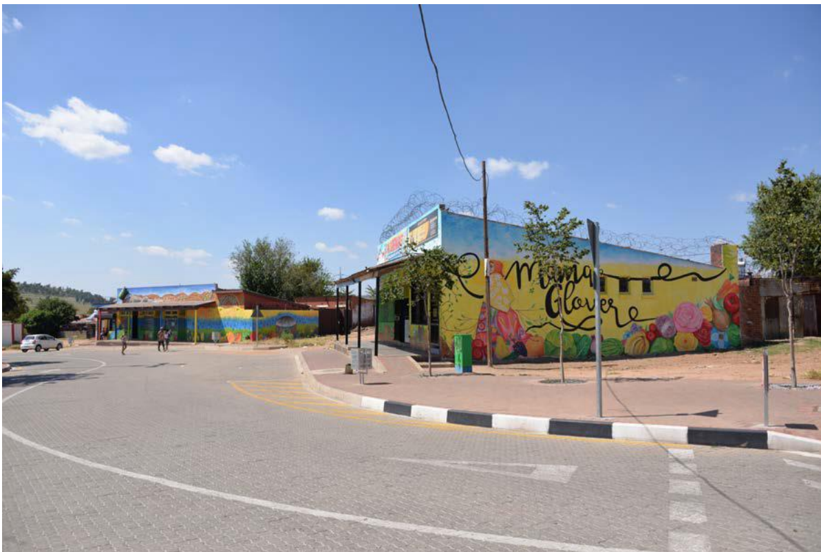
Noordgesig – Le Battis and Rickys Shop Murals (Mama Glover inspired) (2019)