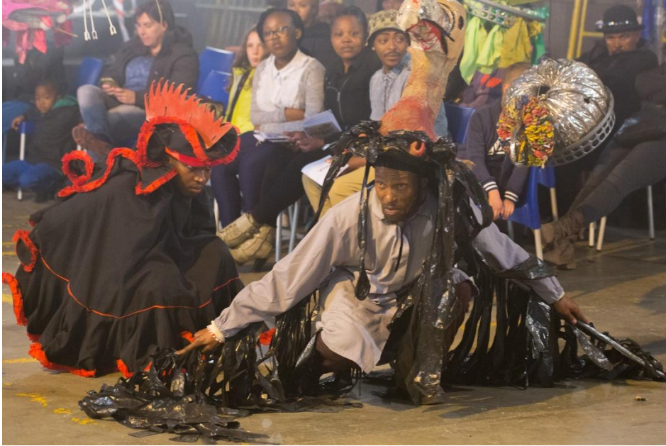
Paterson Park – “The Birds of the Grove” performance (2018)