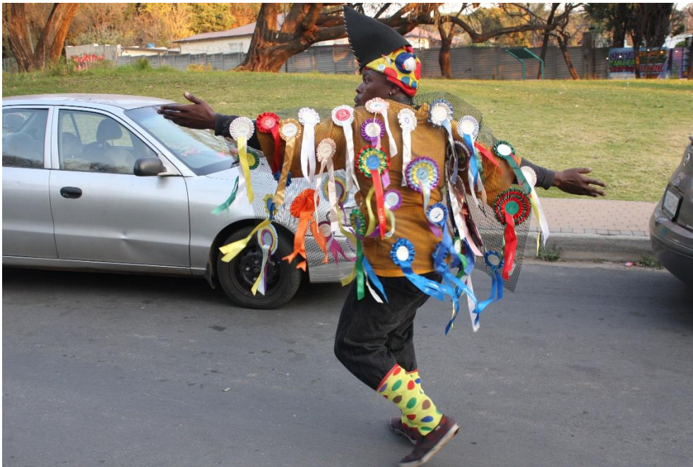
Paterson Park – “The Birds of the Grove” performance (2018)