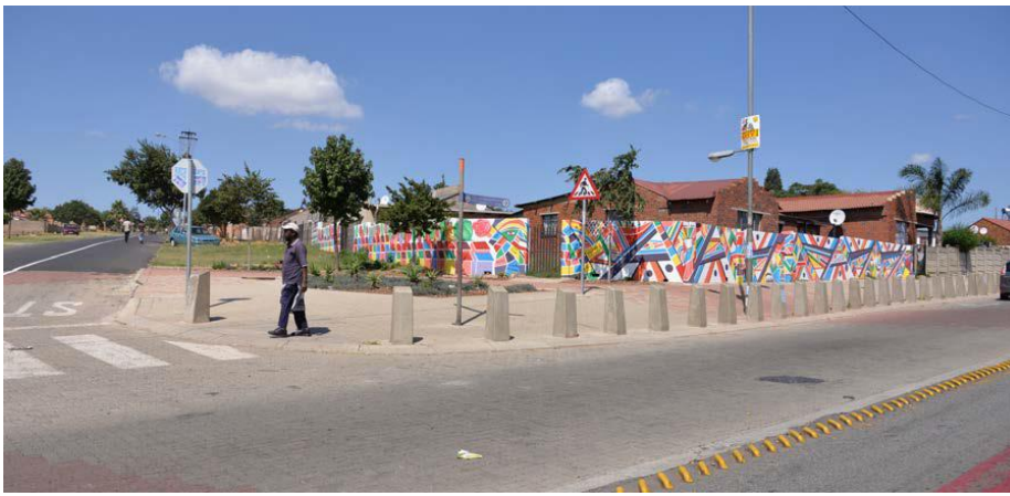
Noordgesig - New Canada Road / Noord Street Gateway Mural (2019)