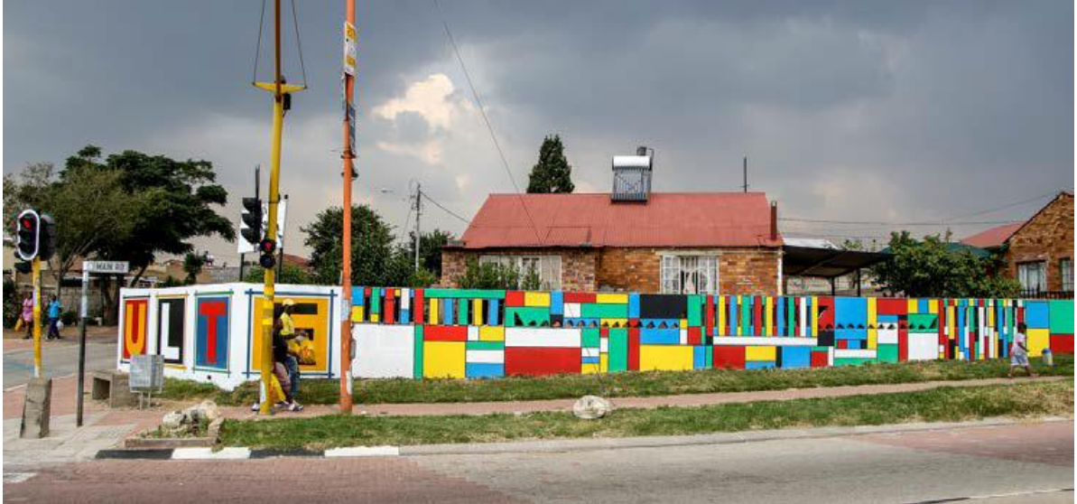
Noordgesig - New Canada Road / Colin Drive Gateway Mural (2019)