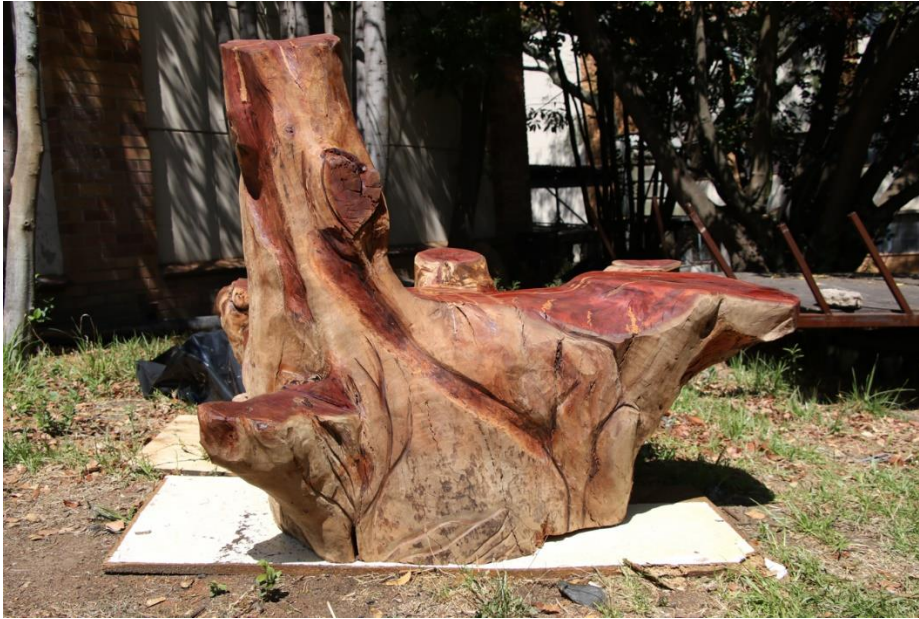
Patterson Park- Hand Carved benches (2018)