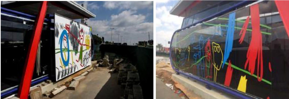
Lees Station – Steel and Glass Panel Artwork, Original Artwork extracted from workshops with Ububele Pre – Primary School and entity of the Ububele Education Psychotherapy Trust in Kew. (2018)