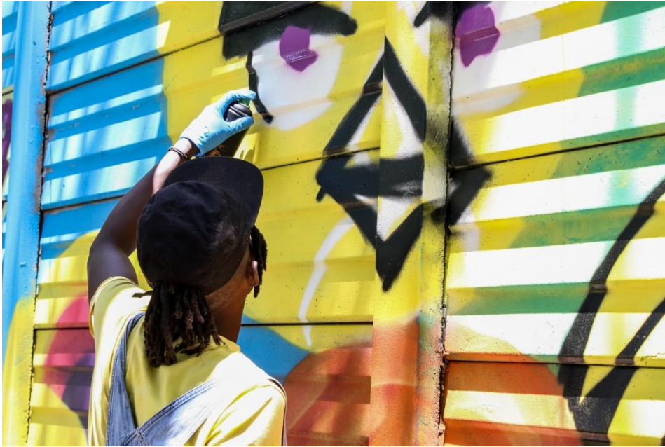
Paterson/Short Road Mural – detail of 130 metre mural situated in Short Road Park, Orchards. (2018)